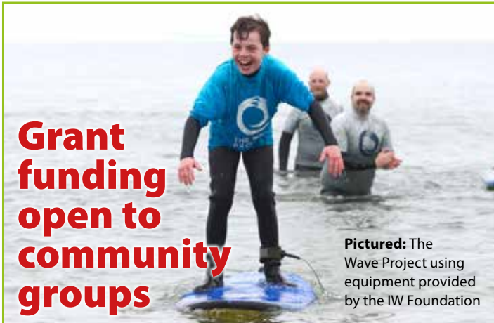
Pictured: The Wave Project using equipment provided by the IW Foundation

Local groups working to tackle social exclusion on the Isle of Wight have been invited yet again to apply for grants of up to £16,000 from the Isle of Wight Foundation as part of its 2020-21 grant funding.