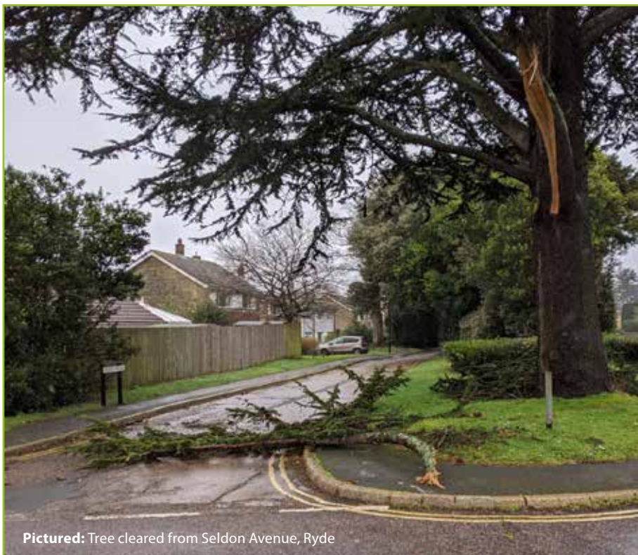
Pictured: Tree cleared from Seldon Avenue, Ryde