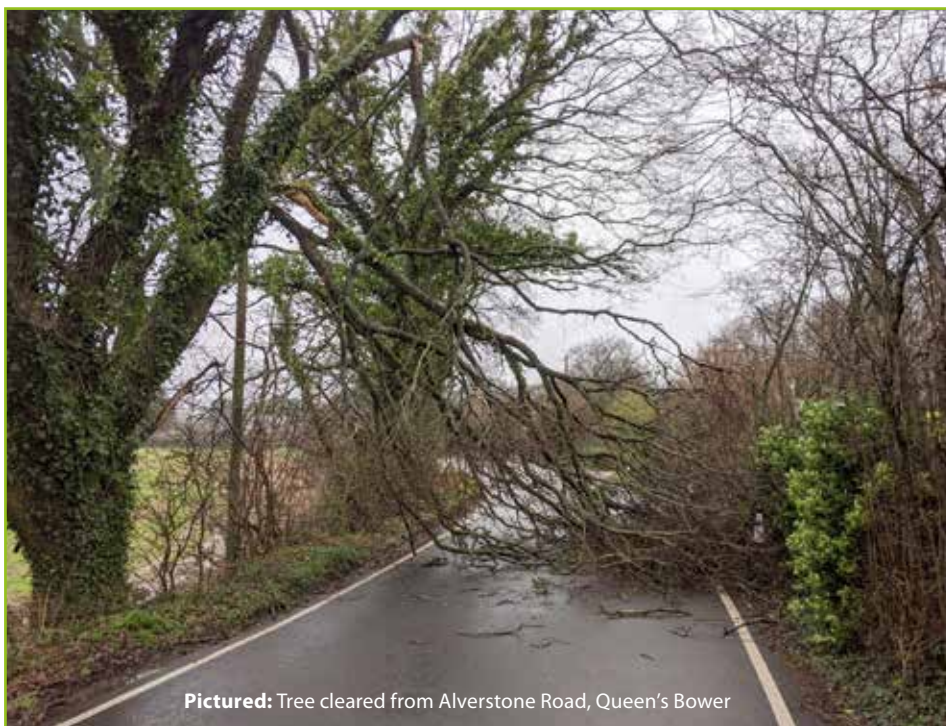
Pictured: Tree cleared from Alverstone Road, Queen's Bower

While the first seven years have delivered the most intense period of activity, there remains an ongoing requirement to keep the average condition of the network up to the agreed level for the duration of our contract with the Isle of Wight Council.