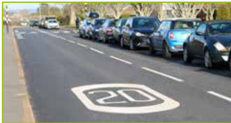
Pictured (top to bottom): Brannon Way Car Park, Brunswick Road Car Park, Lind Place Car Park, Lugley Street Car Park, Crossfield Avenue Cowes