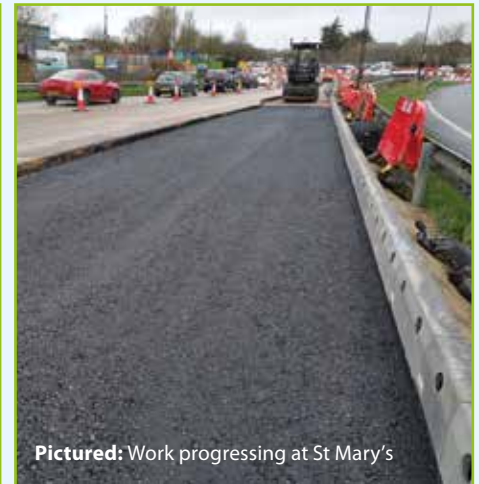
Pictured: Work progressing at St Mary's

Work to complete a major junction improvement scheme at St Mary's, Newport is progressing well and on schedule to enter the next phase of construction after the Isle of Wight Festival.