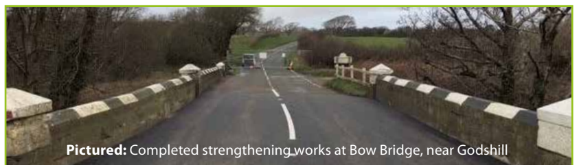
Pictured: Completed strengthening works at Bow Bridge, near Godshill

A major scheme to strengthen a bridge that supports the main road on the approach to Godshill has been completed.