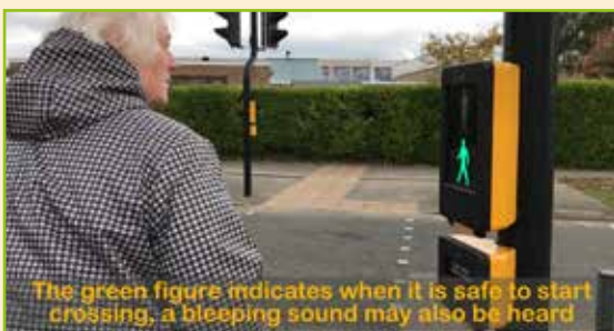
Pictured: Puffin crossing information film

Island Roads has worked with Age UK Isle of Wight to produce a short film showing how to use the new 'Puffin' pedestrian crossings.