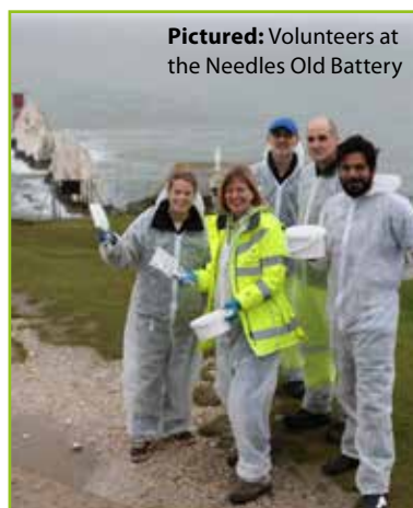
Pictured: Volunteers at the Needles Old Battery

The Needles Old Battery was built in 1862 to defend the western Solent from feared invasion by the French. This never materialised and the battery became known as one of 'Palmerston's